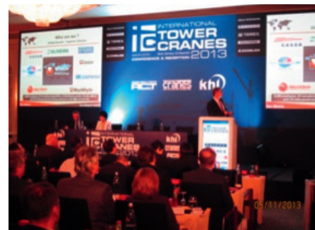
KHL Tower Crane Conference in Berlin, November 2013